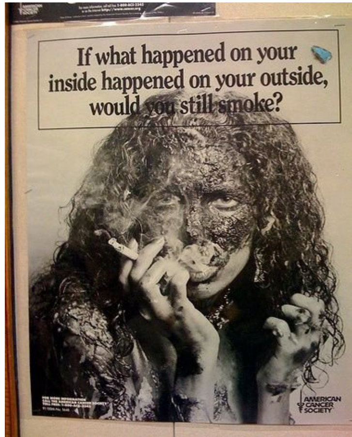
Poster American Cancer Society

We don't just deprive our heart and muscles of oxygen. We daily paint our lungs with the 4,000 chemicals that the tobacco industry collectively refers to as tar. It's too little oxygen and too much gunk.